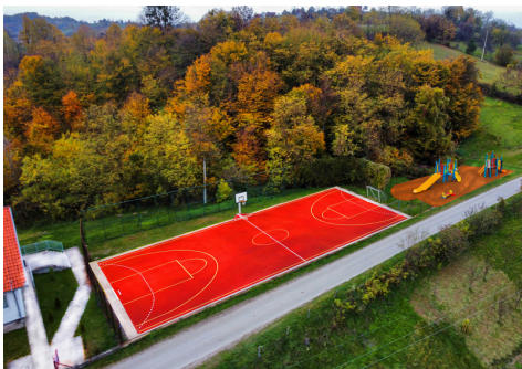
Future vision of the playground