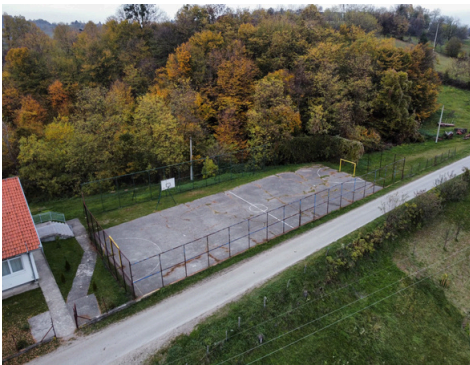
Current state of the playground

From the bottom of our hearts, thank you for being a part of this mission. Together, we are proving that no community is too small to deserve hope and opportunity.